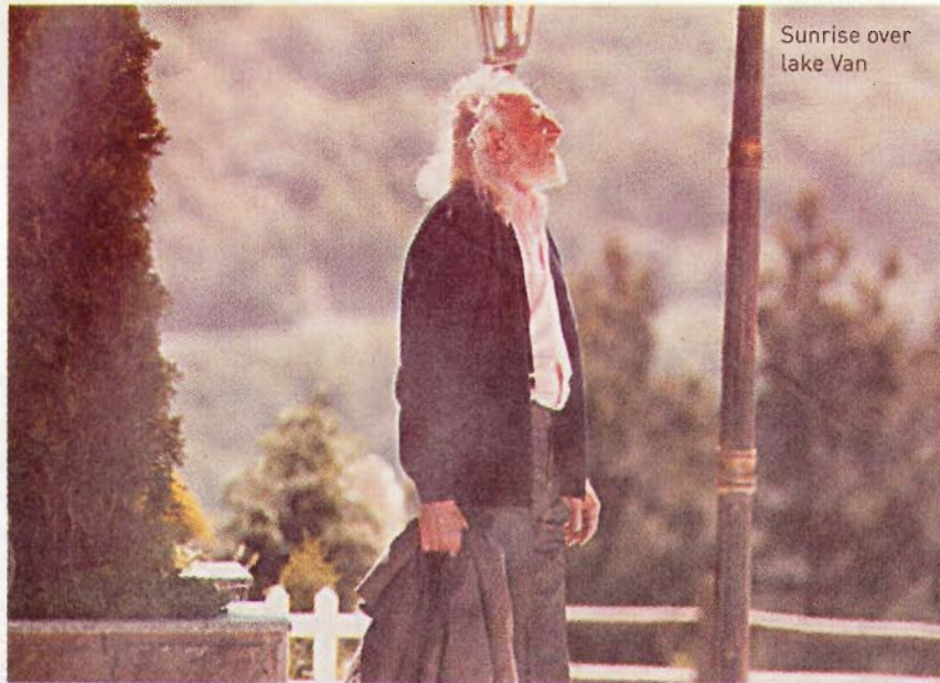
Sunrise over lake Van